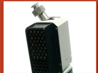
Integrated exhausting with a replaceable dust filter.