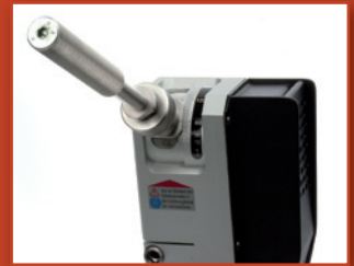
Adjustable grinding angle from 15-180° (included angle).

Industrivej 3 · DK-9690 Fjerritslev · Danmark Tlf. +45 96 50 62 33 · Fax +45 96 50 62 32 info@inelco-grinders.com · www.inelco-grinders.com