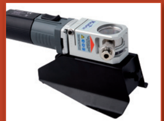
Stand to fix the NEUTRIX to a bench.