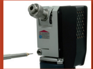
Precise adjustment of the stick-out.